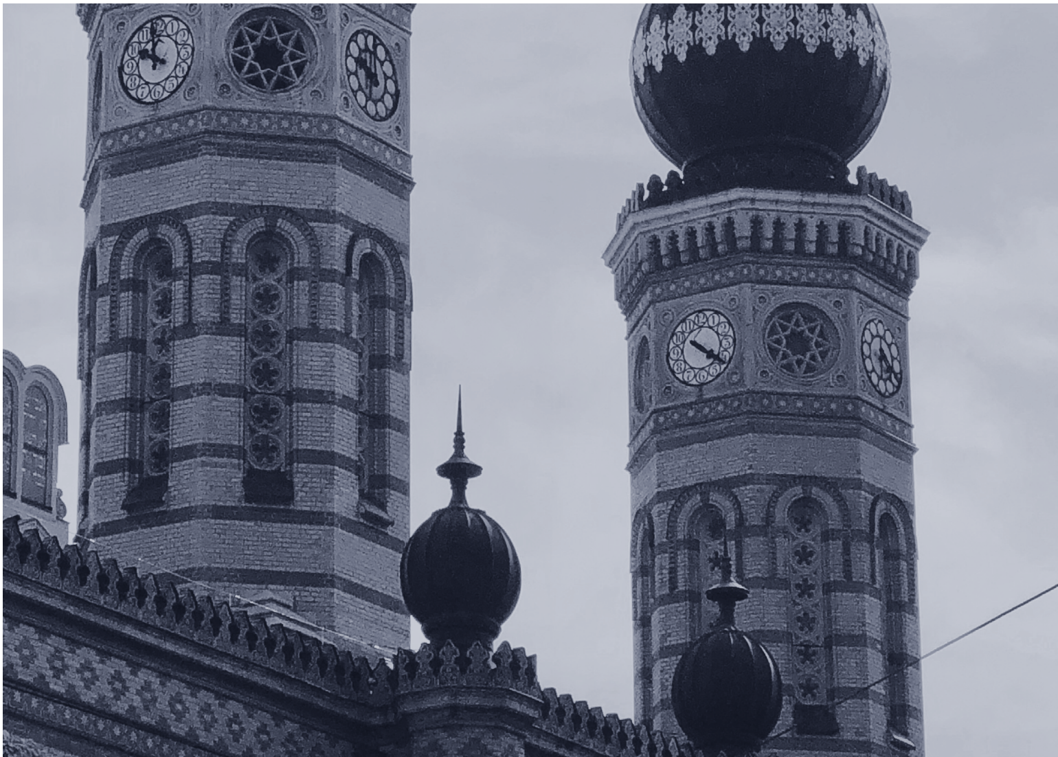
The Great Synagogue in Budapest